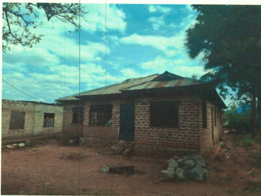
Photo 1: Front view of the house where illegal LPG activities were undertaken