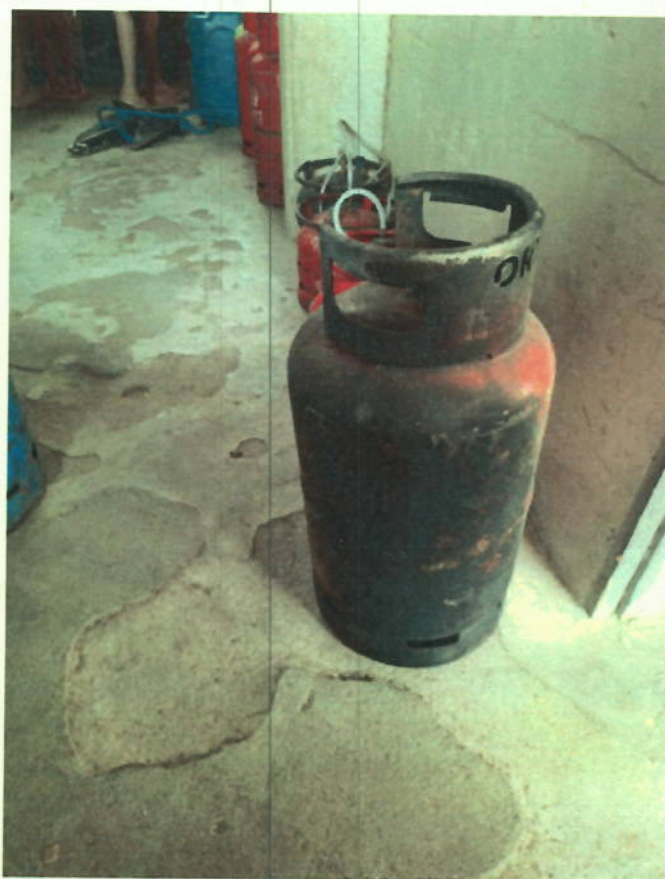
Photo 5: Burnt cylinder seized by The Fire and Rescue Services Force