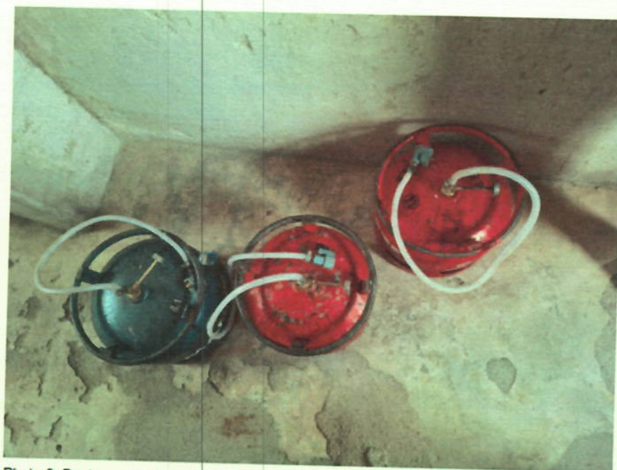
Photo 8: Devices used in decanting and refilling of cylinders seized by The Fire and Rescue Services Force