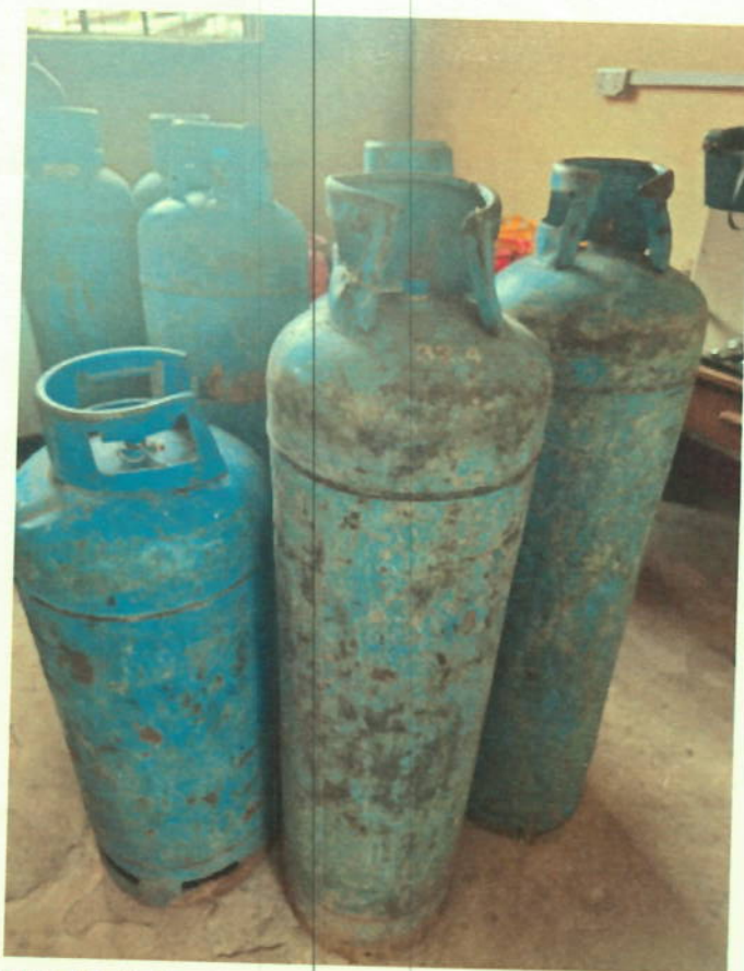
Photo 7. Lake Gas Limited LPG cylinders (38kg) seized by The Fire and Rescue Services Force