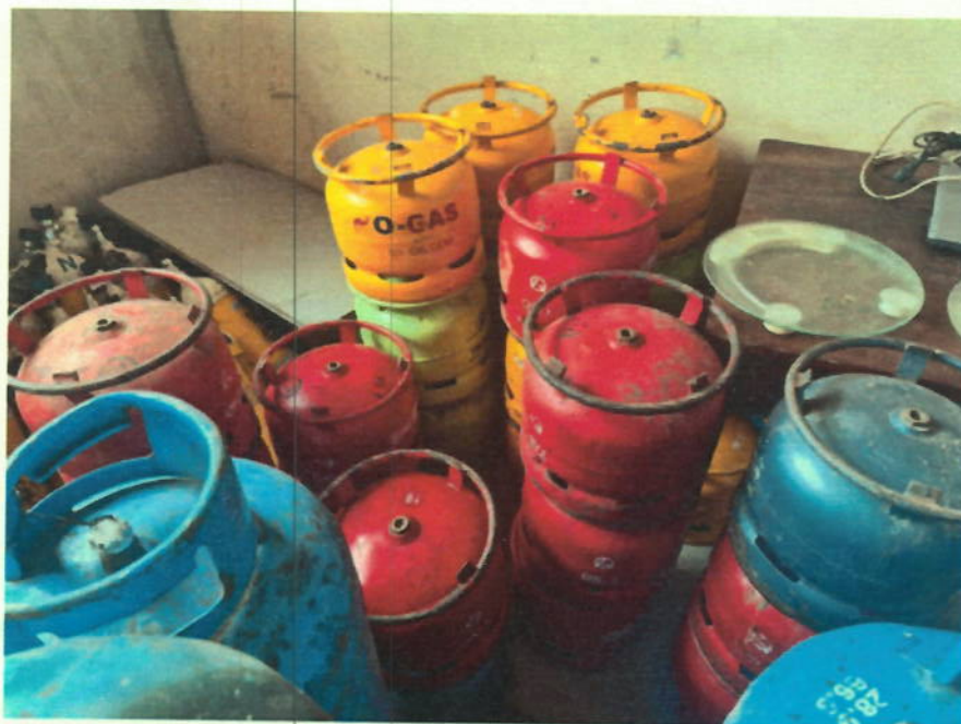
Photo 6. LPG cylinders seized by The Fire and Rescue Services Force